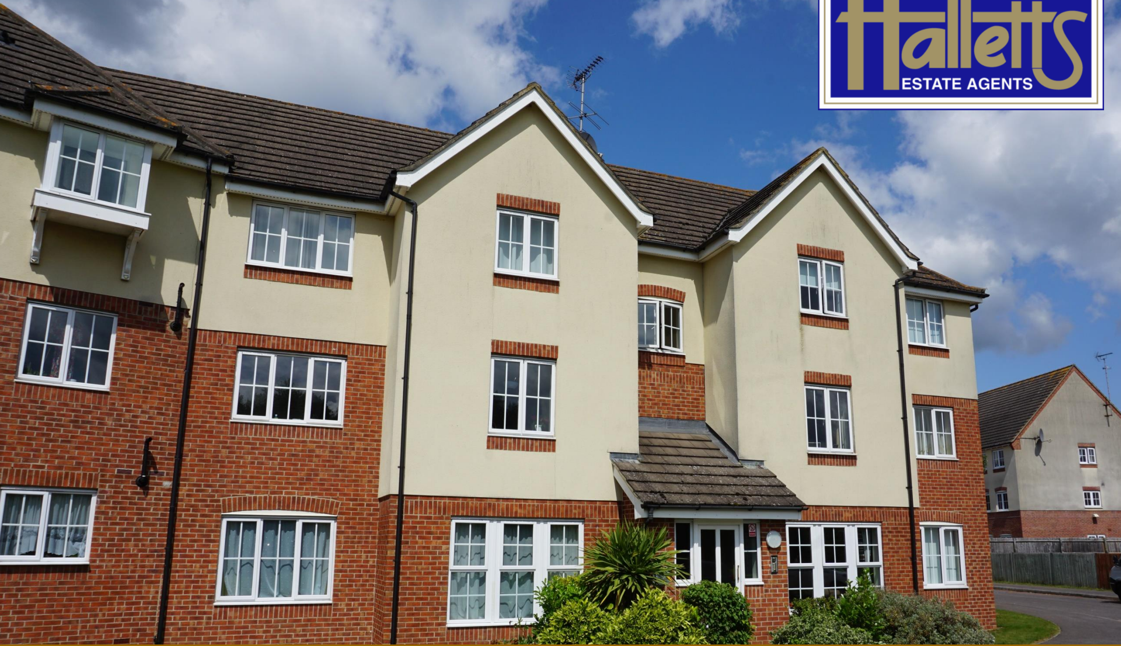
15 Artillery Drive Thatcham Berkshire RG19 4RW